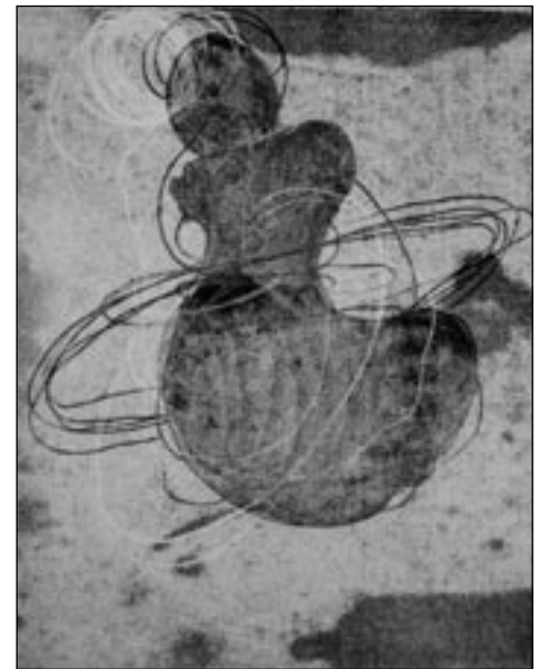
Untitled by Marie Schoeff, 2009. Trace drawing on paper, 14" x 11"