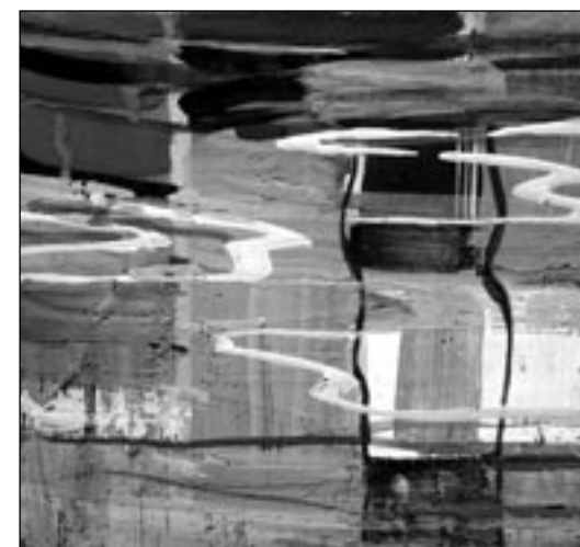
Water Mirrors by Rick Stich on display at Gallery 855 at the Arts Center with an opening reception on Saturday, March 6th from 3-5pm.

Works by some of the finest painters in the Western United States • 1114 State St #9 La Arcada Ct • Daily 11-5pm • 962-8885.