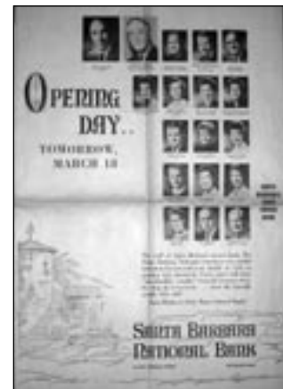
"Opening Day" ad - March 18, 1960