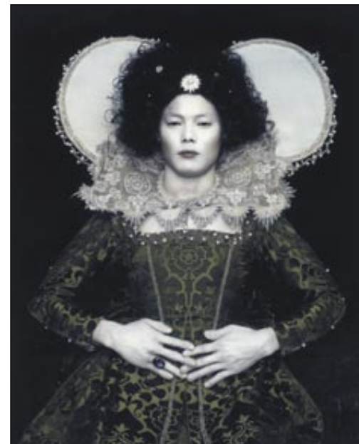
Existing in Costume 1 , 2006, from the series Existing in Costume (2006) by BAE, Chan-Hyo . Chromogenic photograph. Museum purchase with funds from the S.I. Morris Photography Endowment and gift from the artist.