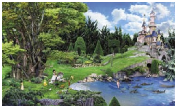
War of Sisters , 2008, from the series Tomorrow (2008) by WON, Seoung Won . Inkjet photograph. Courtesy of the artist and Sarah Lee Artworks & Projects.

The Santa Barbara Museum of Art is located at 1130 State Street and is open Tu to Sun 11-5pm. For information visit www.sbma.net or call 963-4364.