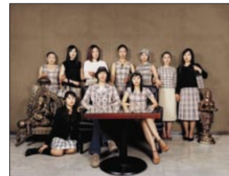
off-line_Burberry internet community , 2005 from the series off-line (2005) by KIM, Sanggil . Chromogenic photograph. SB Museum of Art, Museum purchase with funds provided by PhotoFutures