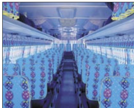
Tour Bus , 2005, from the series Magical Reality (2005-6) by KOO, Sungsoo . Chromogenic photograph. The Museum of Fine Arts, Houston, museum purchase with funds provided by the S.I. Morris Photography Endowment.