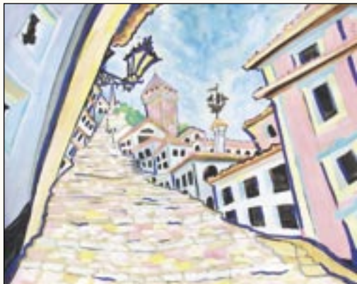
Cobblestone Steps (----1936) by James-Paul Brown , gouache on paper, 30" x 38"