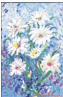
White Flowers by James-Paul Brown , acrylic on canvas, 24" x 16"

New works by James-Paul Brown are on display at Artiste Gallery, 3569 Sagunto St. in Santa Ynez, from 11am-5pm Daily. Contact Artiste at 686-2626.