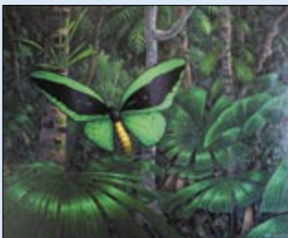
Emerald Butterfly Rhapsody by Bruce Birkland

CASA Magazine is located at 23 E. Canon Perdido and is open Mo-Tu from 9-5pm. For information call 965-6448.